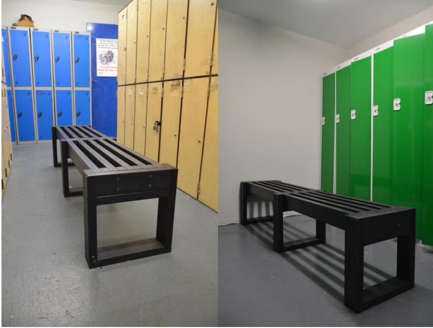
The Plaswood Edge – adding a touch of contemporary design to indoor and outdoor spaces